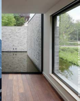
Architect: Bejaux de Blouwer & Chiriacq, BV