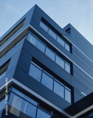
Architect: OMC Architects