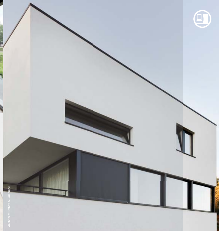
Architect: Crany & Jansinghe