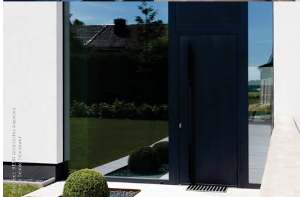
Architect: BE & C Architects Assosies